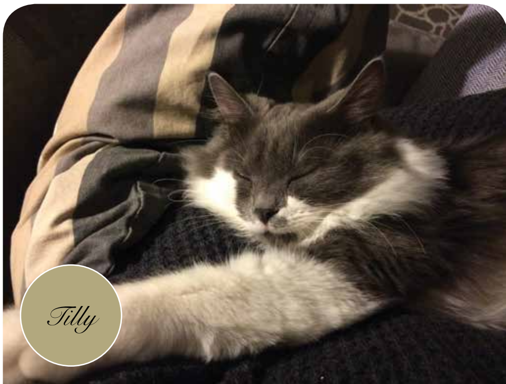
RESCUED BY AN ANIMAL PROTECTION OFFICER